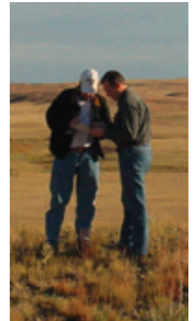
Evaluating Reclamation Success for Bond Release