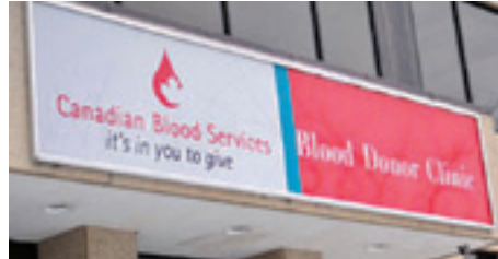
Canadian Blood Services Clinic

To learn more about Partners For Life, go to www.blood.ca and select the Partners For Life icon. To find out where and when you can donate, enter your city at the top of the homepage and get a complete listing of all upcoming local donation clinics. It's just that easy!