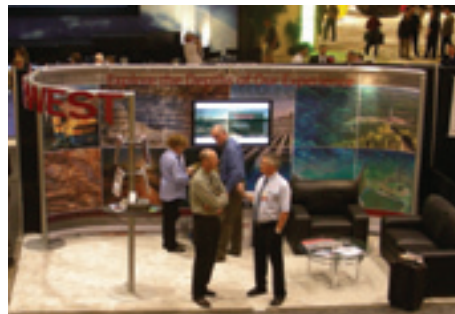
Norwest 2008 MinExpo Booth

For more MINExpo® 2012 information follow the show on Twitter (@MINExpo2012), on Facebook (MINExpo INTERNATIONAL) and on the website ( www.minexpo.com ).