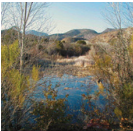
Passive Water Treatment