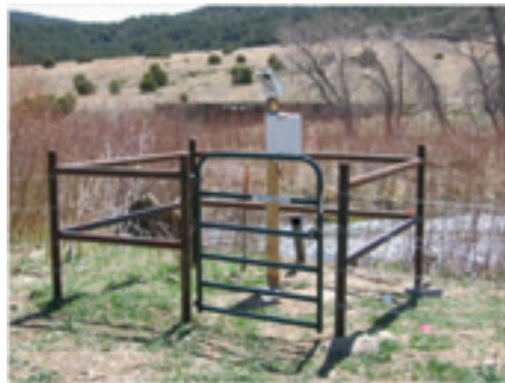
Apishapa River Gaging Station

In 2010, Pioneer extended the water monitoring project concept to the Purgatoire watershed located to the south of the Apishapa watershed with the installation of continuous monitoring equipment at nine locations along the Purgatoire River and its tributaries. One additional CBM operator joined with Pioneer to implement the Purgatoire program. Norwest provides weekly maintenance support to the Purgatoire monitoring program.