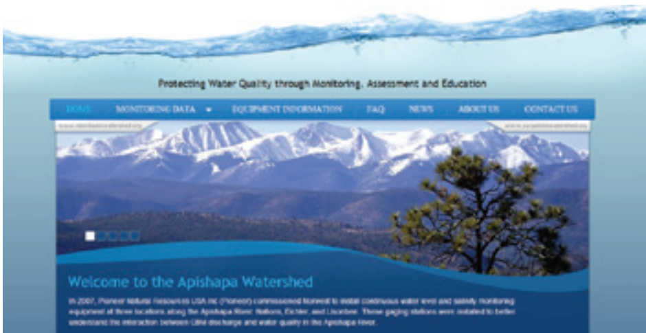
Apishapa Watershed Website

Both the Apishapa and Purgatoire monitoring programs offer cutting-edge technology and provide the community, regulators, and interested parties with the opportunity to view first-hand continuous water quality and quantity data relative to the Apishapa and Purgatoire watersheds. Pioneer's dedication to providing positive stewardship offers the community reassurance that producing vital natural resources, while protecting the environment, can be achieved. To learn more about these programs, please visit www.apishapawatershed.org and www.purgatoirewatershed.org .