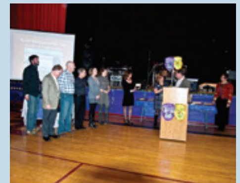
Trinidad, Colorado Small Business of the Year