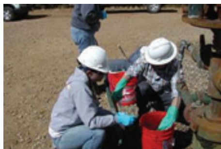
Radiosotope sampling in the Raton Basin, CO