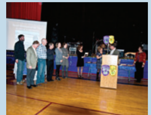
Trinidad, Colorado Small Business of the Year