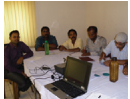
Risk Management Team Training

ICML has applied the principles of risk management to control hazards common to surface mines and unique to rural West Bengal. All supervisors are trained in risk management. Management, with the support of Norwest's experts, has established several teams with responsibilities for specific areas, and the teams' proposed controls are being implemented. ICML has modified their risk management program to fit the distinct cultural, environmental, and geologic needs of SOCM. The company has effectively devised risk controls which make the ICML risk management program an example of how safety tools, if mastered and aggressively applied, can overcome significant challenges.