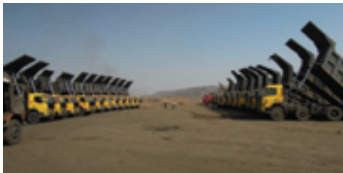
Typical Equipment Staging Line